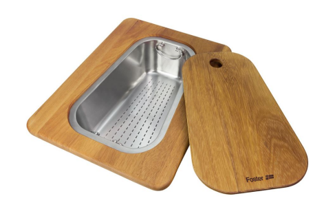
Iroko-wood chopping board with stainless steel colander 8644 042