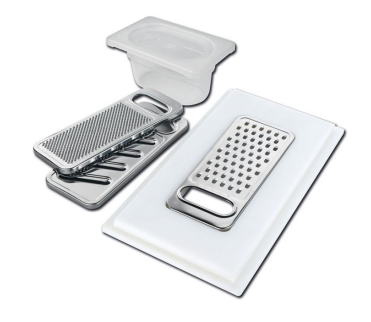
Graters kit with ring-holder and food collection tray 8159 101